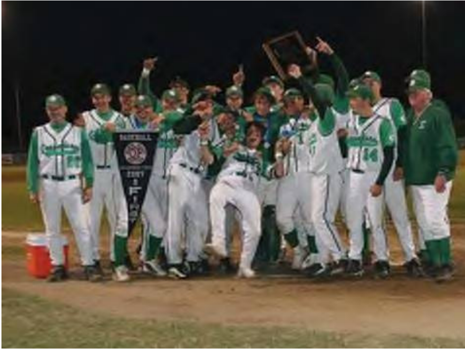
St. Bernard's captured the NCS Class B baseball title on Saturday after routing Tomales 10-1 at the Eureka Babe Ruth Field.